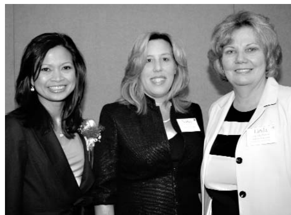
Celebrating 35 years of workplace empowerment at TWIN 2009

As the YWCA Bergen County's Tribute to Women and INdustry (TWIN) awards celebrated its 35th anniversary on April 30th, 2009, it was clear that honoring the accomplishments of professional women—and the staying power of businesses like our sponsors—is as important today as it was when TWIN was established in 1974. The 30 women and 20 companies that received the TWIN Diamond this year are shining examples of the significant role that courage, leadership, and wisdom play in excelling in challenging times. The YWCA was proud to partner with host company, Unilever, which recognizes that creating a diverse work environment that respects, values, and celebrates differences is critical to business success. To them, and to all of our TWIN corporate sponsors, we express our sincere gratitude for their generosity. Our mission lives on through their support.