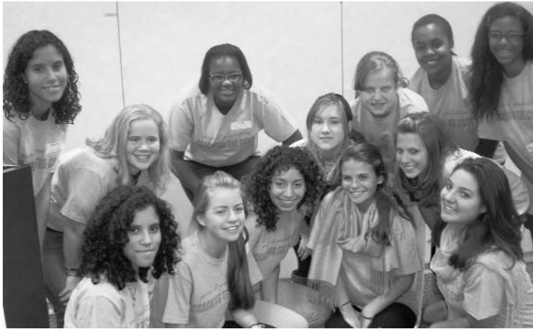
Building relationships and self-esteem at Power & Possibilities 2008