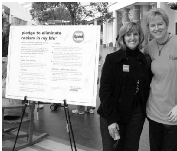
Taking a Stand Against Racism in Paramus Park Mall

For example, we and our YWCA sisters across the country cheered on January 29th, 2009 as President Obama signed his first major piece of legislation: the Lilly Ledbetter Fair Pay Act. The YWCA lent its collective voice to Ms. Ledbetter's victorious fight to convince Congress to counteract a Supreme Court ruling that required employees to file pay discrimination claims within 180 days of receiving the first discriminatory paycheck. The resulting law enables individuals to challenge ongoing pay discrimination and protects employees from workplace discrimination. On April 3rd, 2009, we built on the work our YW has done to promote increased racial understanding from within our organization and took our mission to the streets, hosting a community-wide Stand Against Racism. A regional YWCA initiative aimed at raising awareness about discrimination and celebrating diversity, the Stand Against Racism was launched in 2008 by the YWCA's of Trenton and Princeton. This year, our YW was joined by close to 20 businesses and organizations plus local legislators, community activists, students, and area residents for an event that was the first of its kind in Bergen County—and which promises to be the first of many.