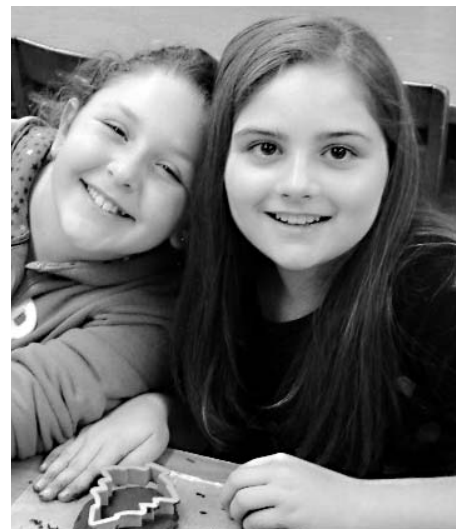
Making friends in a River Vale After School program

This year our YWCA continued its efforts to expand the reach of its child care services and to ensure that they are affordable to Bergen County families. Given the extraordinary economic circumstances, this was no easy task. As demand for financial assistance grew, funding for scholarships decreased. However, we increased the number of sites where we provide before/after school care from 24 to 26. By keeping costs low and providing financial assistance to needy families, our YW helped make summer camp a reality for 13 families (18 children) who could not otherwise have afforded it. And as we prepared to launch our new “Girl Power Camp” (which debuted in July 2009), we were able to offer $4,560 in scholarships so that 11-to-14-year-old girls could enjoy this unique, self-esteem building experience.